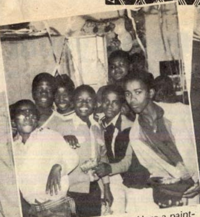
Saturday is for children. Here a painting class poses for a photograph.