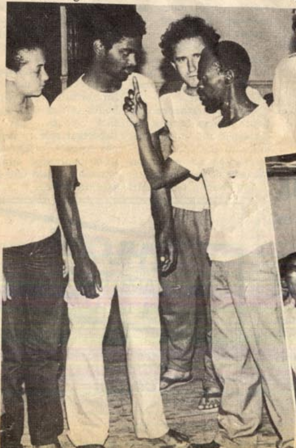
A drama group rehearsing.